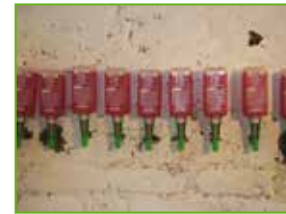
Automatic installation of the horizontal barrier