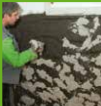
Application of the KÖSTER plaster key