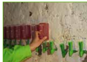
Installation of the cartridges