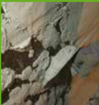
Application of KÖSTER restoration plaster