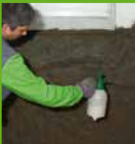
Priming with KÖSTER Polysil® TG 500

KÖSTER restoration plasters are especially designed for the restoration of masonry with high salt and moisture contents. They are also not affected by high salt contents and prevent salts from diffusing to the surface. When rising damp is stopped with KÖSTER Crisin 76 Concentrate, KÖSTER restoration plasters help to dry out the wall and absorb remaining salts. KÖSTER restoration plasters withstand moist conditions since they do not contain lime or gypsum. They are open to water vapour diffusion and help to create a healthy and comfortable room climate.