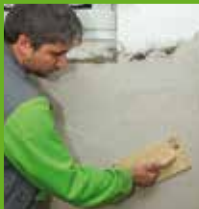
Smoothing the surface

Apply KÖSTER Polysil TG 500 as a primer in order to strengthen the substrate and reduce the mobility of the salt molecules. KÖSTER restoration plasters are available in grey or white. In historic buildings they can be used as a decorative plaster even without painting. They are suitable for interior and exterior use.