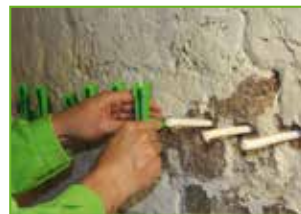
Installation of the KÖSTER Capillary Rods and KÖSTER Suction Angles