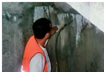
Injection using a low pressure system

The foam, which had already been injected repeatedly into the construction joints, was worn down by movements of the building structure and thus let water pass through after a relatively short time. After installation of the injection packers, KÖSTER KB-Pur® 2 IN 1 was injected in the first work step until the material began to discharge from the substrate.