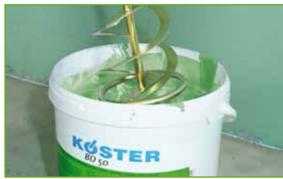
The first step is to stir up KÖSTER BD 50. Use a slowly rotating electrical mixer (400 rpm) to stir the material in the bucket for 1 minute.