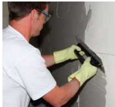
After the KÖSTER Hydrosilicate boards have been applied the surface can be sanded smooth. Subsequently the whole area is plastered with a layer of KÖSTER Hydrosilicate Adhesive SK in a