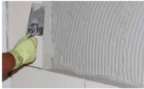
A bead of KÖSTER Hydrosilicate Adhesive SK is applied along edges of the boards to make sure that the joints are fully filled.