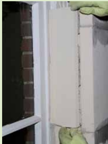
For detailed areas such as jambs and soffits around windows and doors that won't allow using the 50 mm thick boards, 25 mm