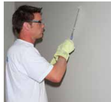
maximum thickness of 2 mm. In normal room conditions and with good air circulation the surface can be decorated after 24 hours with breathable materials.