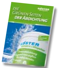
Die Green Pages of Construction Chemicals