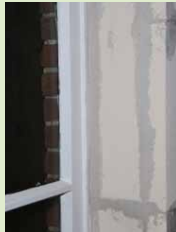
boards are also available. These are applied flush to the previously installed wall boards and offer an optimal finish.