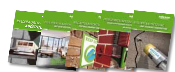
Die KÖSTER System brochures