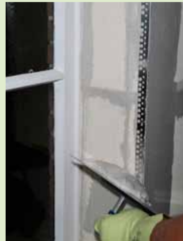
Exterior corners should be protected by installing a corner profile.