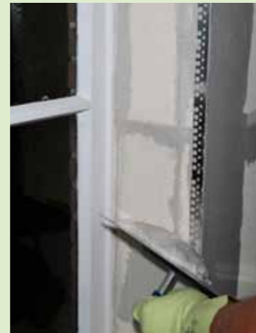
Exterior corners should be protected by installing a corner profile.