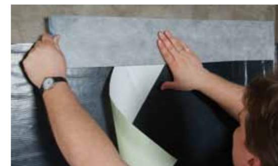
If no separate base waterproofing is installed, the upper edge of the waterproofing layer has to end approx. 30 cm above grade. In order to achieve an attractive visual appearance, the upper edge of the membrane can be covered with the cold self-adhesive KÖSTER Butyl Fix-Tape Fleece. This tape can be plastered over.