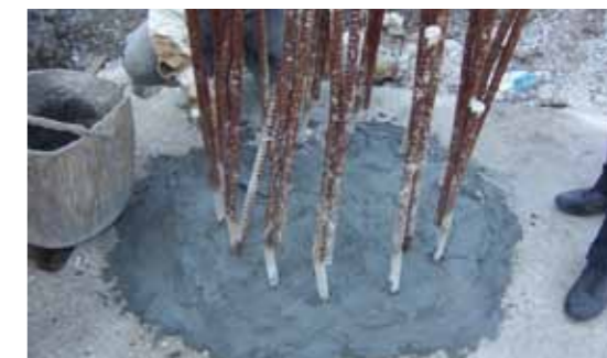
Installing a fillet and smoothing the area with KÖSTER Repair Mortar