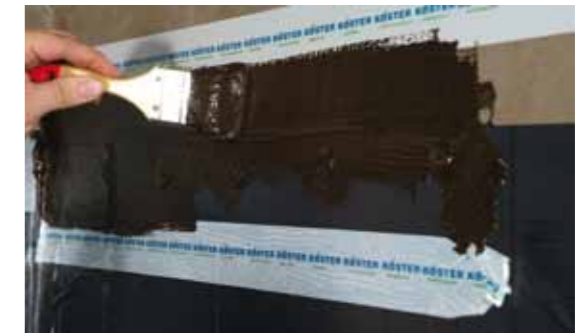
The edges of the membrane are sealed with KÖSTER KBE Liquid Film.