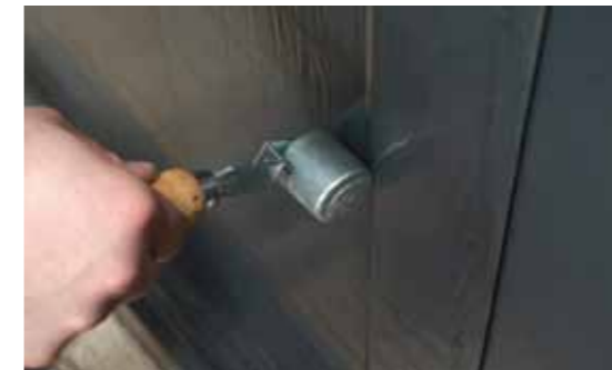
Use a roller to firmly press the membranes onto the substrate.