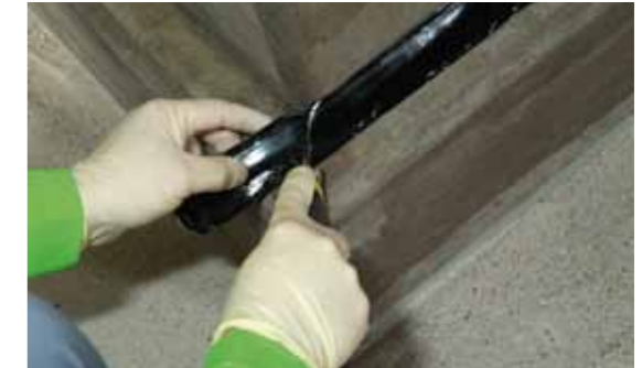
Fillets can be made of either KÖSTER Repair Mortar or alternatively with the cold self-adhesive KÖSTER KSK Triangular Ribbon.