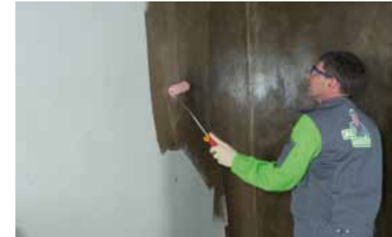
After priming the substrate, fillets are installed at the wall-floor junction.