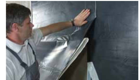
The area is waterproofed with the membrane. Membranes must overlap by approx. 10 cm.