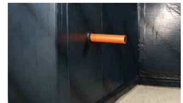
Finished waterproofing with KÖSTER KSK