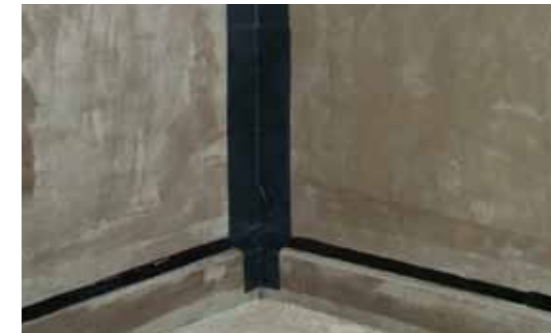
After that, the membrane is applied to inside and outside corners.