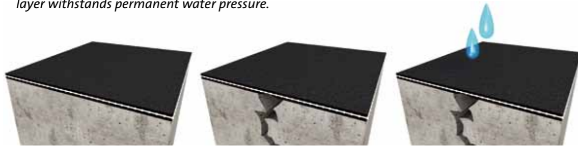
3. Crack bridging due to an embedded mesh. The mesh separates the top waterproofing layer from the crack and helps significantly to withstand permanent water pressure.