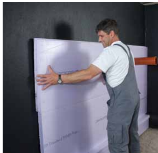
XPS boards completely bonded with KÖSTER Deuxan®

coarse aggregates. During backfilling, these aggregates can be pushed into the waterproofing layer and damage it. For this reason the installation of a protective layer is required.