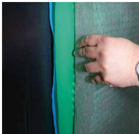
KÖSTER SD Sheet 3-400 protects the waterproofing and provides a drainage for residual water.

Back filling of the construction pit and settlement of the ground over time are frequent sources of damage to the waterproofing layer. Usually the material used to backfill the construction pit does not consist of clean sand but contains