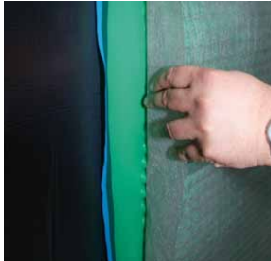
KÖSTER SD Sheet 3-400 protects the waterproofing and provides a drainage for residual water.

Back filling of the construction pit and settlement of the ground over time are frequent sources of damage to the waterproofing layer. Usually the material used to backfill the construction pit does not consist of clean sand but contains