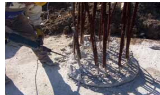
Removing protrusions, cleaning the pile head

a building which means the waterproofing on the pile head has to resist high compression. Thirdly, it is important to connect the area waterproofing well to the pile head waterproofing. Here the steps of waterproofing of a pile head are shown.