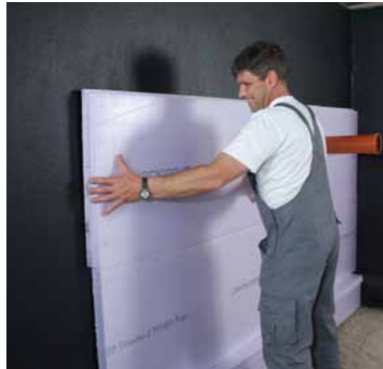
XPS boards completely bonded with KÖSTER Deuxan®

coarse aggregates. During backfilling, these aggregates can be pushed into the waterproofing layer and damage it. For this reason the installation of a protective layer is required.