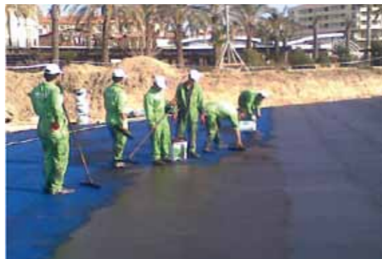
Waterproofing with KÖSTER Deuxan®

For the waterproofing of a slab cementitious systems, bituminous liquid applied systems, or membranes can be used. KÖSTER KSK membranes have the advantage that one can