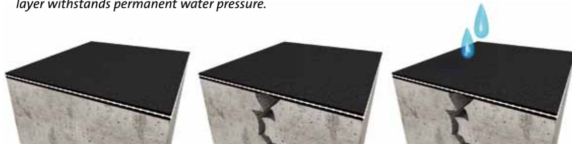
3. Crack bridging due to an embedded mesh. The mesh separates the top waterproofing layer from the crack and helps significantly to withstand permanent water pressure.