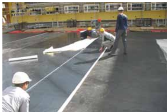
Waterproofing with KÖSTER KSK Membranes

e.g. two layers of polyethylene foil, and finally a protection layer in order to not destroy the waterproofing layer with subsequent building activity.