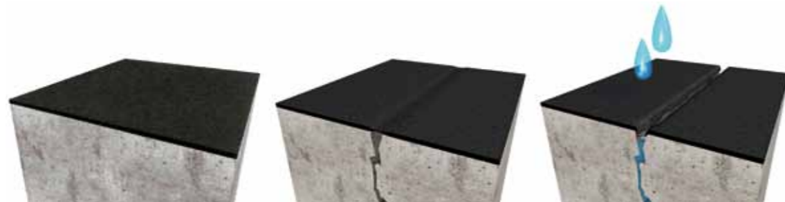
1. Elastic but not crack bridging: The waterproofing layer does not withstand the permanent water pressure.