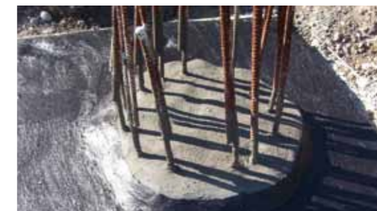
Connection of the area waterproofing (KÖSTER Deuxan®) to the pile head waterproofing