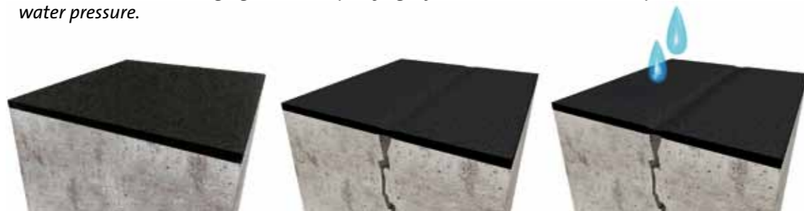
2. Crack bridging waterproofing: In this case due to elasticity and layer thickness. The waterproofing layer withstands permanent water pressure.