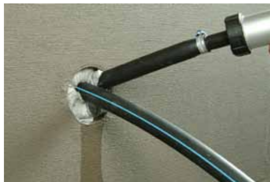
Then KÖSTER KB-Flex 200 is filled into the void using the KÖSTER Special Caulking Gun.