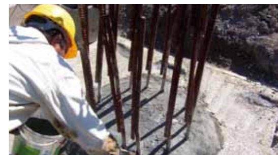
Waterproofing of the pile head with KÖSTER NB 1 Grey