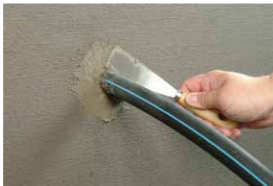
The pipe penetration is now waterproof. In order to protect the waterproofing the area around the pipe or cable is plugged with KÖSTER KB-Fix 5.