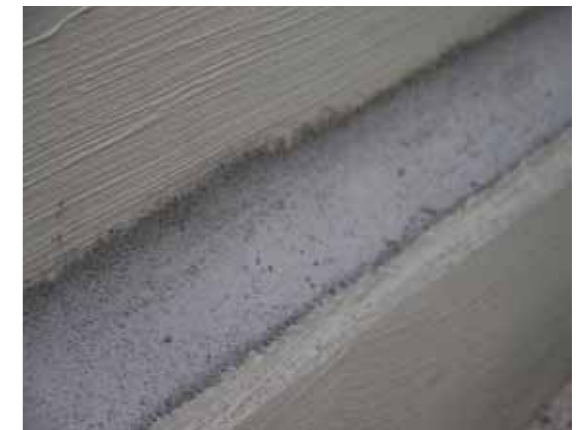
A concave fillet in the wall-floor junction with KÖSTER Repair Mortar

To install a fillet, KÖSTER Repair Mortar is the material of choice. The leg length of the fillet is usually 4–6 cm. A fillet made of KÖSTER Repair Mortar can be covered with any waterproofing material including bitumen thick films. Before the installation of a fillet, prime the substrate with KÖSTER NB 1 Grey.