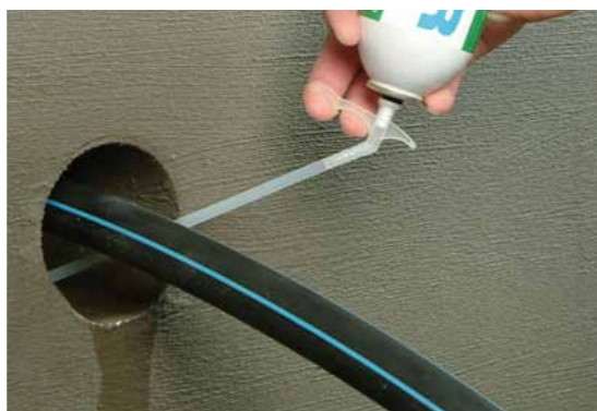
A PU-Foam is injected in order to have a backing for the KÖSTER KB-Flex 200.

While a wall area may be easy to waterproof, a pipe and cable penetration is not. The main problems that occur with pipe and cable penetrations are possible movements of the pipes or cables, and that materials passed through pipe and cable penetrations have very different characteristics, (polymers, concrete, metal etc.). The waterproofing solution has to be plastic, (as opposed to "elastic"), so that movements can be absorbed and bonding to a wide variety of materials is possible. Sometimes a cable may have to be removed or a new cable routed. The KÖSTER KB-Flex 200 System provides the solution for this problem even if it is a repair with active water ingress.