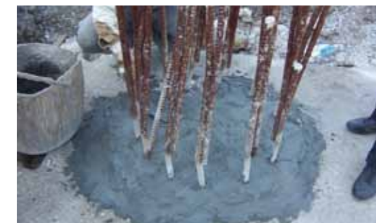
Installing a fillet and smoothing the area with KÖSTER Repair Mortar