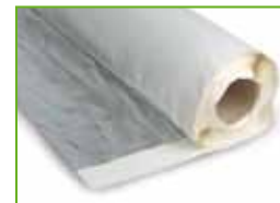
KÖSTER KSK ALU 15