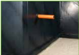
The waterproofing is installed.