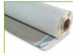
KÖSTER KSK ALU Strong