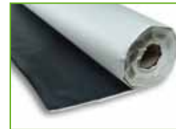
KÖSTER KSK AW 15