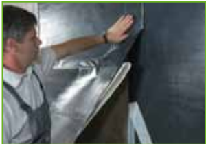
Applying the membrane