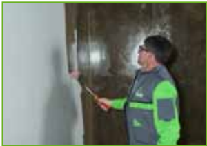
Priming the substrate