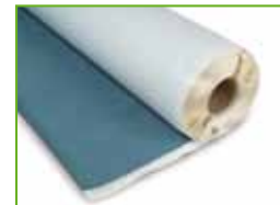
KÖSTER KSK SY 15